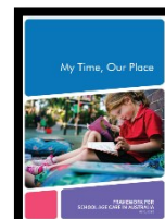
My Time, Our Place; Framework for School Age Care in Australia 2022 V2

Critical reflection: is a meaning-making process that assists informing future practice in ways that demonstrate an understanding of each child's learning, development and wellbeing and implications for equity and social justice. It involves examining and analysing events, experiences and practices from a range of perspectives to inform future planning and decision-making ( Early Years Learning Framework 2022 V2 – refer to Sources ).